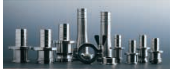
Standard connectors include Tri-clamp, DIN, RJT, IDF-ISS plus others for custom systems.