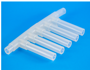
One-piece overmolded C-Flex® manifold maintains inner bore diameters with superior reliability and product integrity.